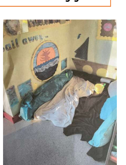
2HW reading corner