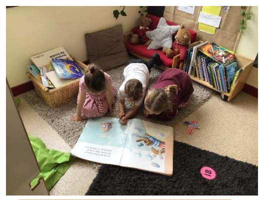
FS2 reading corner...

Next half term we are looking forward to story time in the hall with members of staff. We are also going to be reading to our peers in other year groups too. We are looking forward to sharing stories and books.