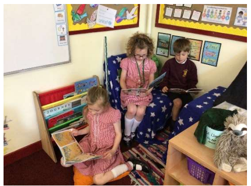
2RL reading corner...